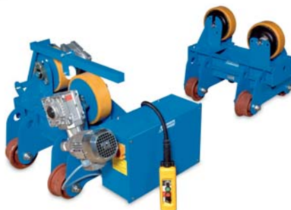
Special rotators (small tubes)